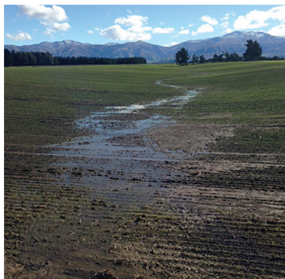
Figure 1. Examples of critical source areas

Critical source areas are those parts of the landscape, such as swales and gullies, where overland flow and seepage converges to form small channels of running water, which may then flow to streams and rivers. (Figure 1).