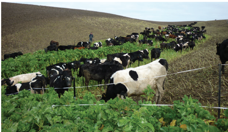
< Figure 3. Last break critical source areas.