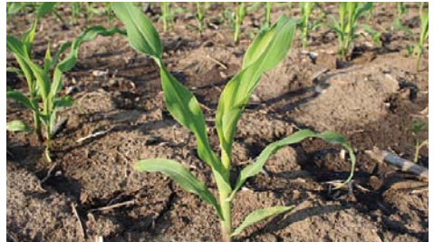
Note four leaves with clearly visible collars.

Continue monitoring for slug and bird damage but also to check for greasy cutworm and weeds. Greasy cutworm feed at night by typically cutting and felling maize plants. Their presence can be confirmed by digging around the base of freshly felled plants or examining plants near dusk. Spraying with a synthetic pyrethroid insecticide at dusk gives good control.