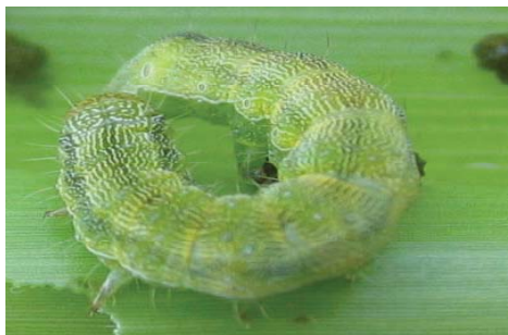
Armyworm caterpillars - green, then greenish brown when older.

Leaf diseases (if warm and humid) appear during this time. Monitoring for common rust, eyespot, and northern corn leaf blight (more common in long term maize land) is important if less resistant hybrids have been used. Fungicides will give control but are seldom used unless environmental conditions are particularly favourable to disease. Generally around the 20-30th December is the time to check for army worm caterpillar especially if crops are weedy. Note that corn earworm often appears in January as the cobs are pollinated. They are generally controlled by parasitic wasps. Corn earworm should not be confused with armyworm.