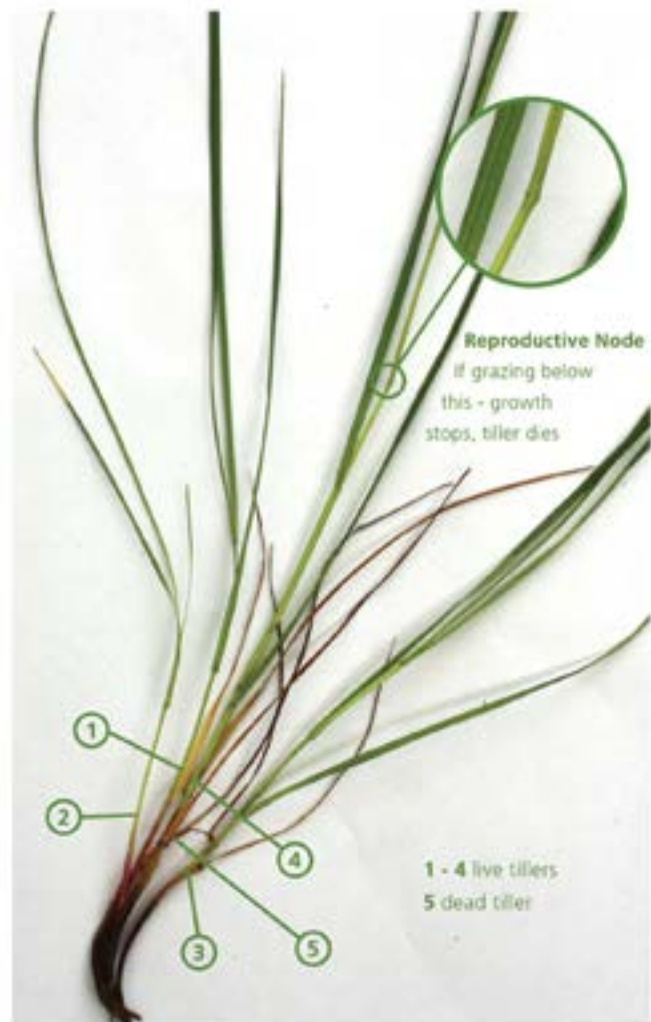
Figure 4: A large ungrazed ryegrass plant with four live tillers. One of these tillers (inset) shows an elevated node. The growing point is now above this node, indicating seed head development. This growing point is normally close to ground level. Grazing or cutting below the node causes this tiller to die. A replacement tiller is required to keep tiller density.